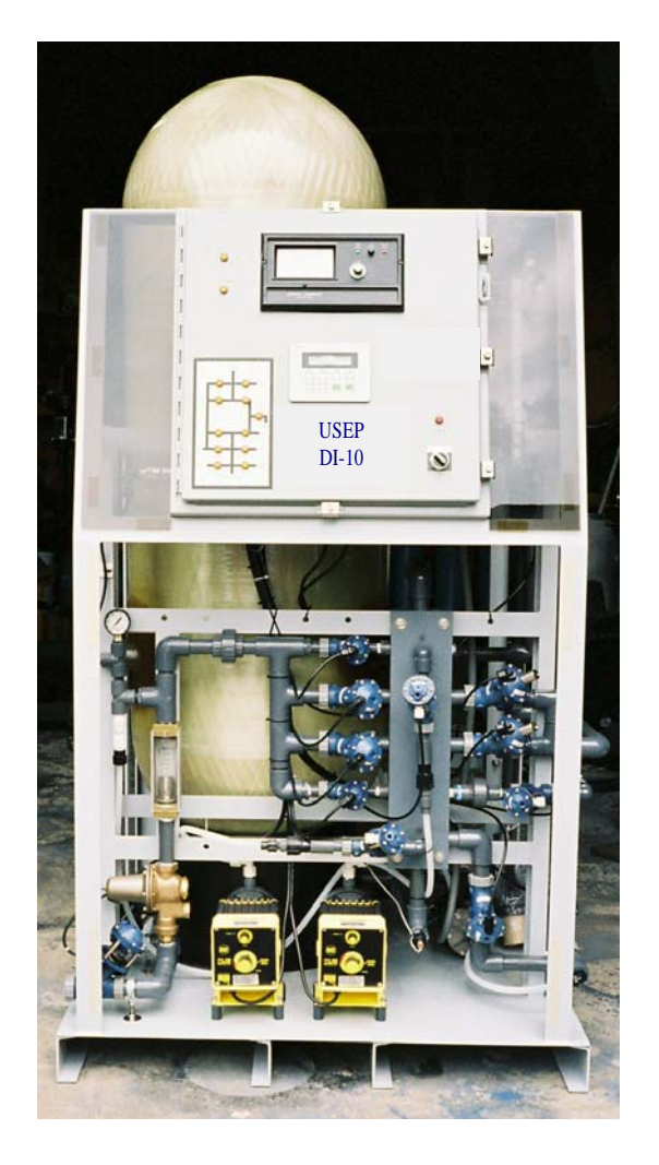
US Engineered Products DI System Advanced Deionization Equipment for Water Purification.

The US Engineered Products Advanced DI-10 Mixed Bed Deionizer is a completely automatic ion-exchange system designed to remove soluble ionized impurities from water. It produces up to 900 gallons of pure water per hour or, with intermediate storage, up to 18,000 gallons per day, and regenerates its ionexchange resins when necessary. Product water quality is guaranteed by a highly accurate controlling purity meter which is factory pre-set to divert all outlet water below one megohm-cm resistively (at 25°C). The purity meter may be adjusted to a higher or lower set point, if required, to meet special requirements.